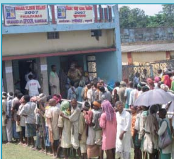
EFICOR's emergency response team distributed thousands of relief packages to families affected by the floods in August 2007.